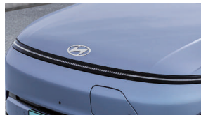
Pixelated Seamless Horizon Lamp