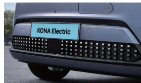
Intake grille garnish