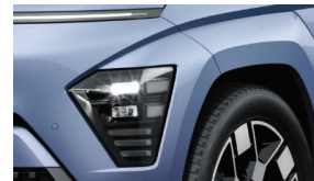
Body colored wheel arch cladding