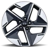
18-inch Alloy wheel