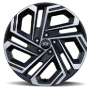
19-inch Alloy wheel